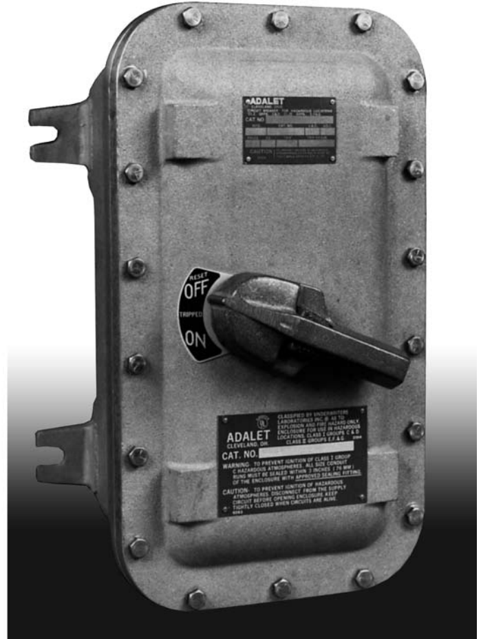
Optional XCBH 2-2 handle shown; standard handle is XBO.