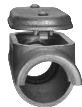
Crouse-Hinds Form 7 (C57, 1-1/2") 26 Cubic Inches Capacity