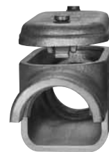
Appleton FM7 (C57, 1-1/2") 28 Cubic Inches Capacity Flat-Back Design

Illustrated views are cut away to demonstrate back configurations.