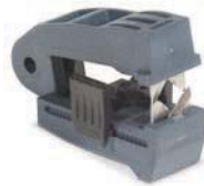
"V" Blade Cassette