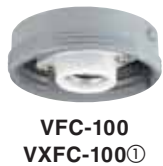
VFC-100 VXFC-100 ①

boxes. They may also be mounted to VJ Series, VB Series or other 4" outlet boxes with the use of the appropriate adapter plate. Each fixture body is supplied with gaskets.