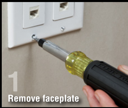
1 Remove faceplate