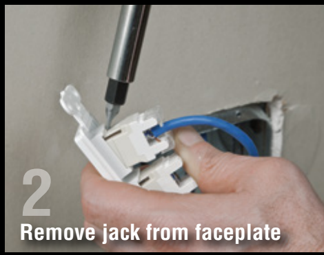
2 Remove jack from faceplate