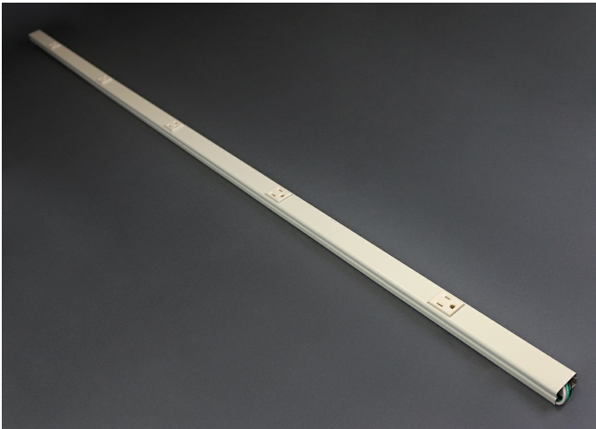
5' Plugmold Multioutlet System with 5 single outlets, GB