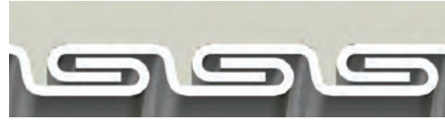
Interlocked Design 1-1/2" through 4" with no bonding wire