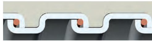
Square-Locked Design with integral bonding wire 3/8" through 1-1/4"