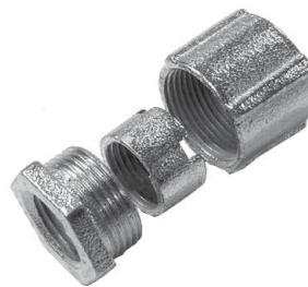
TPC - 50