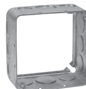
TP443 (2½" Deep)