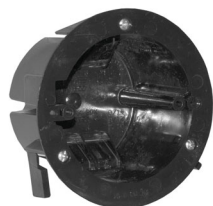
TP16200, (TP16201 – 2 1/8" Deep) Old Work

Weight limit: 50 lbs. for fixture except where indicated.