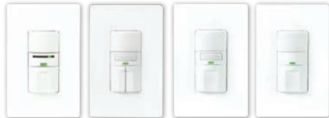
OS106D1 OS310R OS310U OS306U