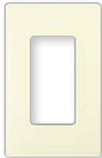
LA Light Almond