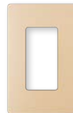
DS Desert Stone