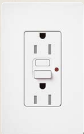
Tamper resistant GFCI receptacle