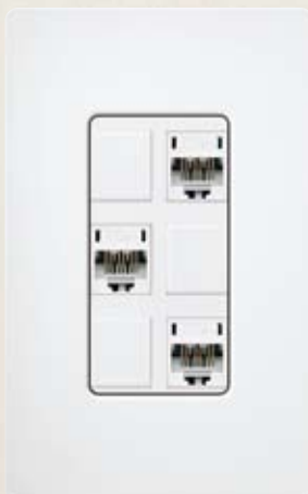
Customizable 6-port frame