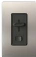
SS Stainless Steel

*Coordinating wallplates only available separately. For wallplate information, see pg. 160.