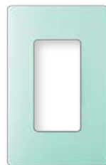
SG Sea Glass