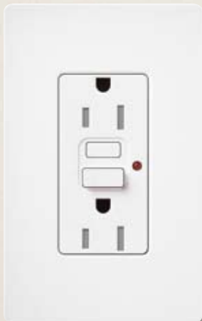
Tamper resistant GFCI receptacle