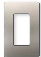
SS Stainless Steel*

*Stainless Steel finish wallplates include black plastic trim/adaptor, visible from side. Match with separate Black (BL) or Midnight (MN) controls and accessories.