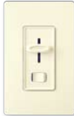
LA Light Almond