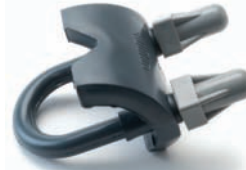
Right Angle Beam Clamp