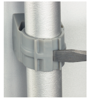
Removable Use screwdriver

Fast and easy to install, one-piece, non-metallic QuickLATCH™ mounts to walls, metal strut and studs, and threaded rod up to 1/4-20...works with Arlington's Strut Clip™ too. Strut Clip holds pipe hangers securely on strut.