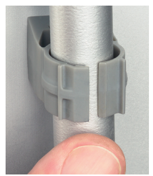
Press down on pipe to lock it firmly in place.