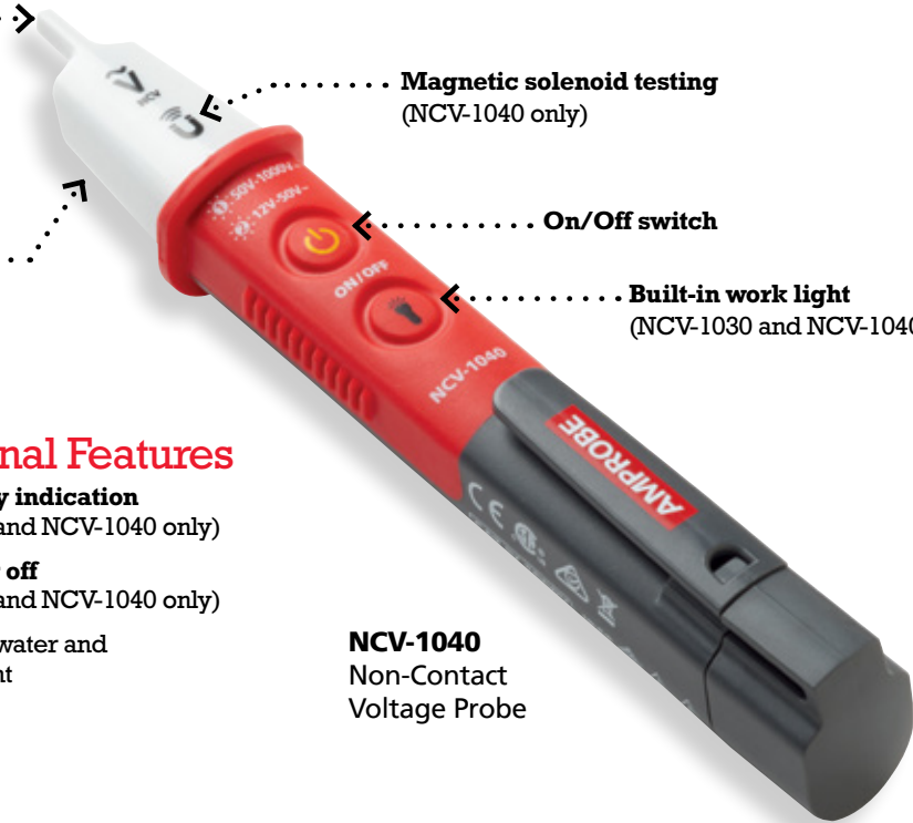
NCV-1040 Non-Contact Voltage Probe