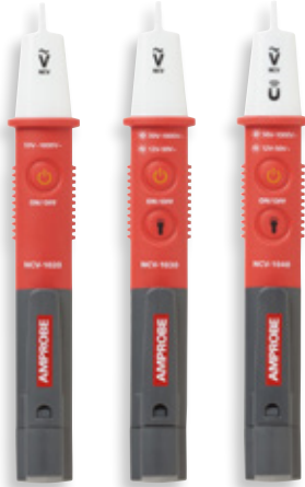
NCV-1000 Series Non-Contact Voltage Probe

The Amprobe NCV-1000 Non-Contact Voltage (NCV) tester series provides maximum safety and convenience for detecting AC voltage without interrupting electrical systems. Designed to conveniently fit in your shirt pocket, the NCV-1000 series performs in indoor and outdoor settings. Safety tested to the highest category measurement, CAT IV 1000 V, as well as IP65 water and dust resistant, the NCV-1000 series is fit for the toughest industrial applications.