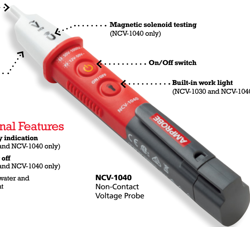
NCV-1040 Non-Contact Voltage Probe