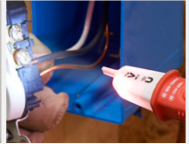
Built-in worklight (NCV-1030, NCV-1040)