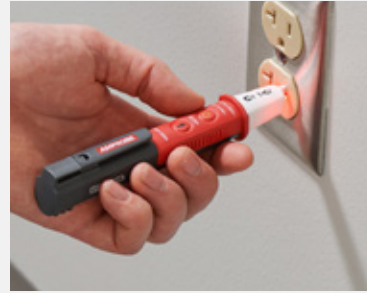
Test wall sockets for AC voltage