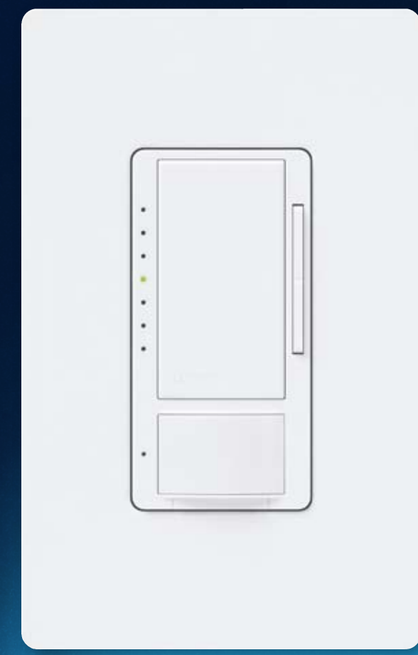
NEW Maestro occupancy/vacancy sensor with dimmer (actual size)