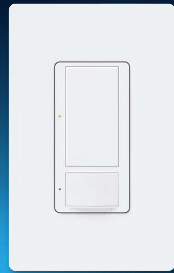
NEW Maestro occupancy/vacancy sensor with switch (actual size)