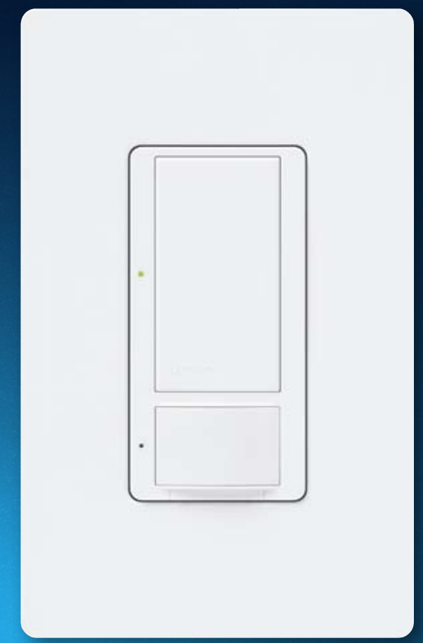
NEW Maestro occupancy/vacancy sensor with switch (actual size)