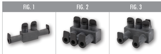
Figure varies by number of wire ports.