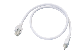
HU103 24" Daisy Chain Connector