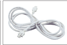
HU1011 18" Daisy Chain Connector