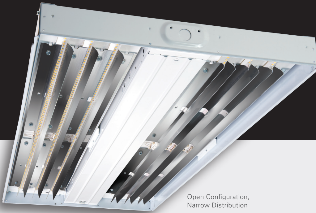
Open Configuration, Narrow Distribution

The HBLED delivers industry-leading performance and reliability for a variety of high-bay applications. Precision designed optics, multiple distributions, lumen outputs and color temperatures make the HBLED ideal for industrial, commercial, manufacturing, gymnasium and other applications that utilize traditional HID and linear fluorescent high bays. The proprietary low-power, low-brightness LED module assembly offers exceptional optical performance with the enhanced benefits of LED lighting, including energy savings, extended system life, and a reduced carbon footprint.