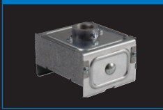
HBL-SPM=Single Monopoint Hanger w/Hub (Galvanized)