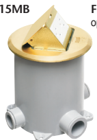
FLBT6615MB open on FLBC4500 concrete box