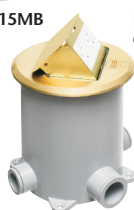
FLBT6615MB open on FLBC4500 concrete box