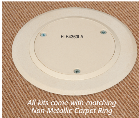
All kits come with matching Non-Metallic Carpet Ring

DROPIN kits are also available with NON-METALLIC Blank Covers. They're perfect for covering unused receptacles. To use the receptacle simply remove the blank cover.