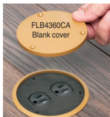
FLB4360CA Blank cover

Cover Installation Install gasket. Attach metal or non-metallic blank cover to box with (3) #8 x 1/2" flathead machine screws. When using the in-use non-metallic cover, substitute the colored in-use plate for the black gasket support plate.