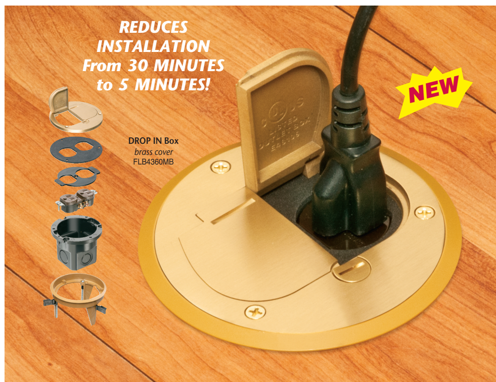
DROP IN Box brass cover FLB4360MB

FIVE MINUTE installation with SINGLE Hole Saw • Low Profile Covers