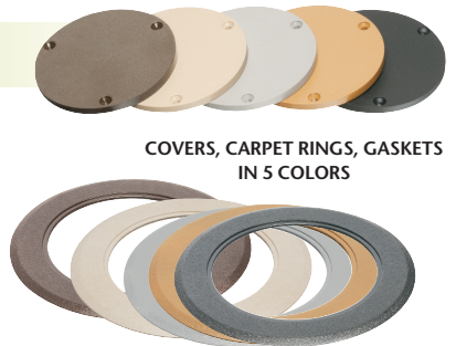
COVERS, CARPET RINGS, GASKETS IN 5 COLORS

DROP IN BOX Kits with BLANK NON-METALLIC COVERS include non-metallic box, round 4" diameter non-metallic cover blank, non-metallic gasket support plate, gasket, carpet ring, UL Listed 15 amp TR duplex receptacle, mounting bracket, NM94 and NM95 cable connectors, (3) #8 x 1/2" flathead screws and (1) #6 x 1/2" screw.