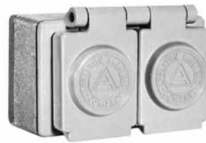
Duplex Cover on FS Box.

Typical application with NEMA configuration receptacle and plug, mounted on an FS box. Gasket seals around plug, keeping out moisture and dirt. Spring door closes automatically when plug is withdrawn to protect receptacle.