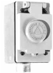
Single Cover on FS Box.