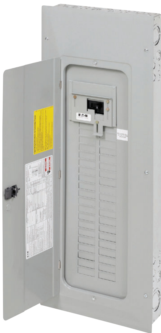
Type BR Loadcenter with Mechanical Interlock Kit

With the aging electrical infrastructure and frequent severe storms, power outages are becoming more and more frequent affecting thousands of people nationwide. Eaton's Mechanical Interlock kit provides an easy and cost effective solution when using back-up emergency power.