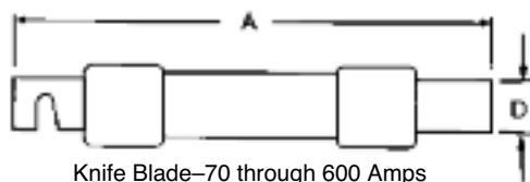
Knife Blade—70 through 600 Amps