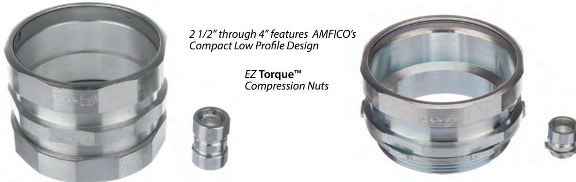
2 1/2" through 4" features AMFICO's Compact Low Profile Design

Available: Solid Alloy Steel Construction, Precision Machined EC Series: Compression Feature: AMFICO EZTorque Compression Nut Zinc Plated, Chromate Finish - Colors available Insulated Throat Bushing Option Available on Connectors*