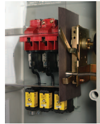
Enhanced Line Shield and Interlock Defeater