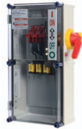
Halyester CUBEFuse Safety Switch with Clear Cover