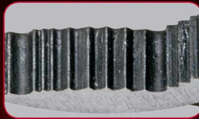
More Gripping Teeth