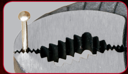
Nail Holding Groove