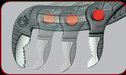
Wider Jaw Opening