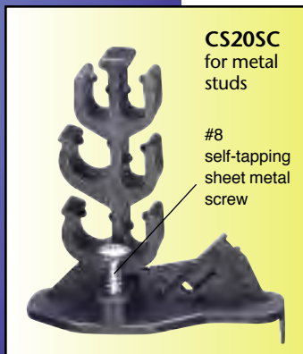
CS20SC for metal studs