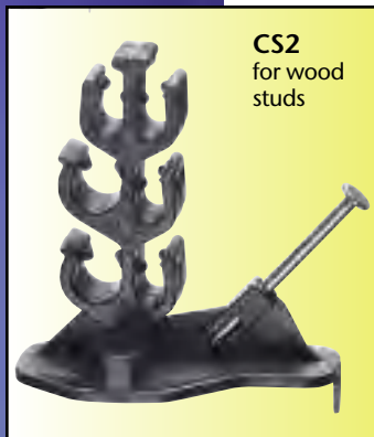
CS2 for wood studs