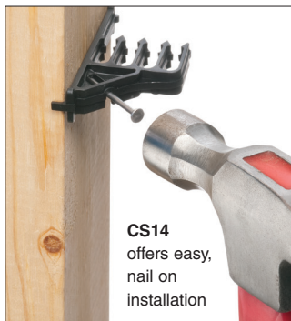
CS14 offers easy, nail on installation