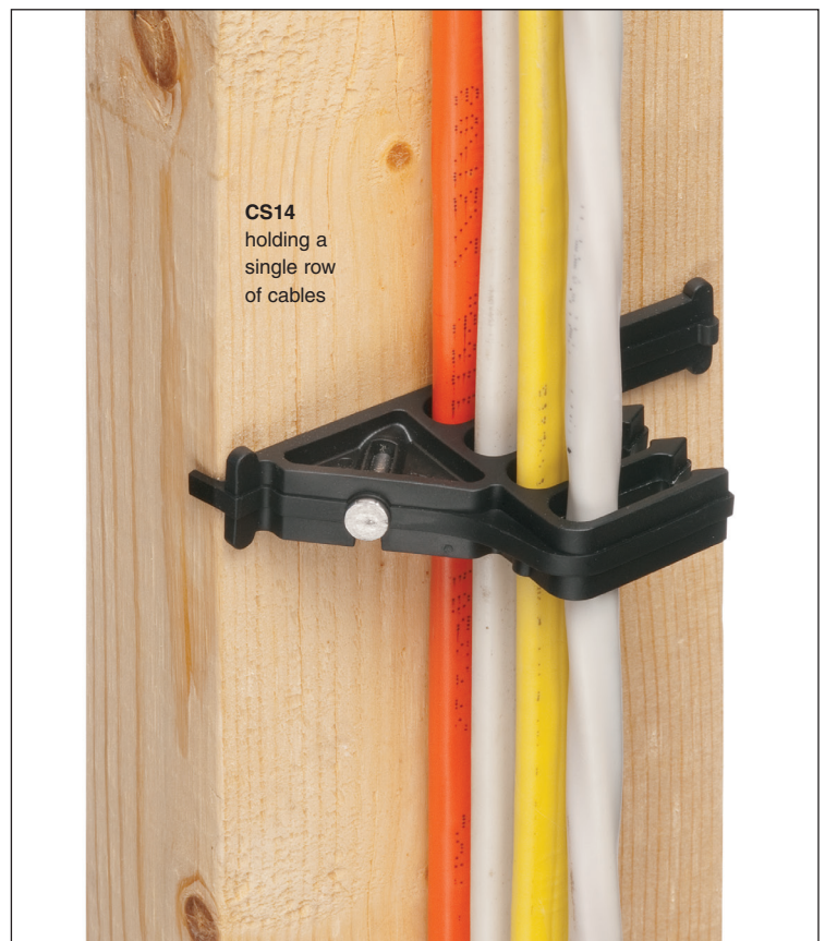
CS14 holding a single row of cables