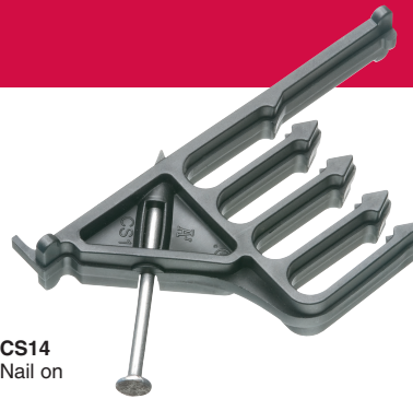
CS14 Nail on