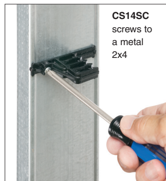
CS14SC screws to a metal 2x4