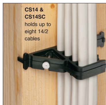
CS14 & CS14SC holds up to eight 14/2 cables

The SPACER™ holds a single or double row of cables - centered on a 2x4!