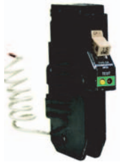
Type CH Single-Pole CAFCI Circuit Breaker