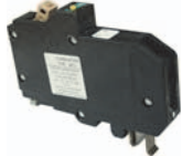
Type CH Single-Pole PON Combo AFCI Circuit Breaker