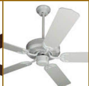
CD52W BCD-5W White finish with White blades.