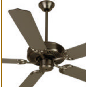
CD52BN BCD-5BN Brushed Nickel finish with Brushed Nickel blades.