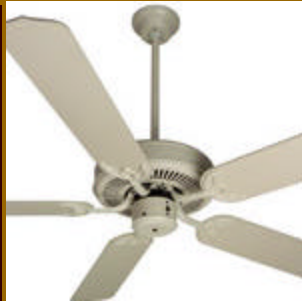
CD52AW BCD-5AW Antique White finish with Antique White blades.