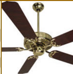
CD52PB BCD5-RW3 Polished Brass finish with Rosewood blades.