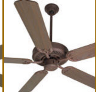
CD52BS BCD5-WWB Brownstone™ with Washed Walnut Birch blades. (Brownstone™ is a registered trademark of Dolan Designs.)