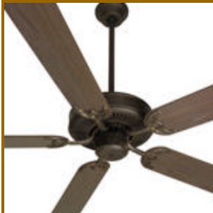
CD52EB BCD5-WB6 Antique White finish with Walnut Satin blades.