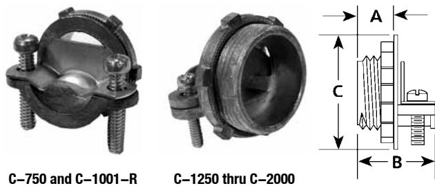
C-750 and C-1001-R