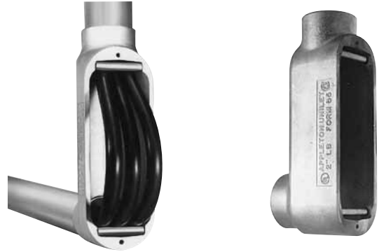
2" Type LB with rollers shown