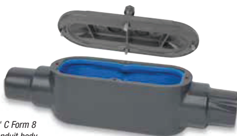
2" C Form 8 conduit body and cover