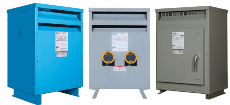
Flex Center transformer solutions

Contact our transformer experts today. Call 915-401-8316 or email TransFlexSupp@eaton.com