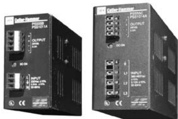
Table 7. PSS Power Supply Selection