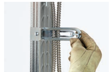
Once cables are inserted, wrap zip-tie around the end of the support to secure the cables