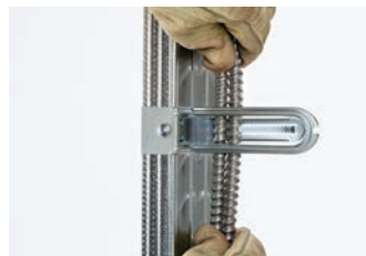
Insert Cables to be secured