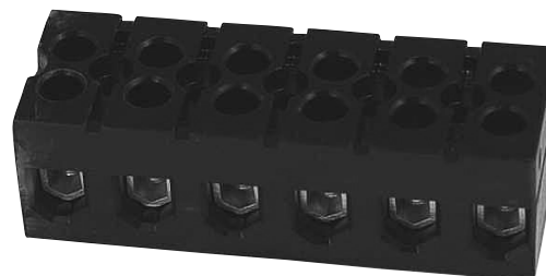
985 GP 06