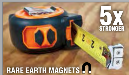
5x STRONGER RARE EARTH MAGNETS