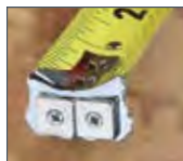
Rare earth magnets are 5x stronger!