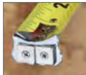
Rare earth magnets are 5x stronger!