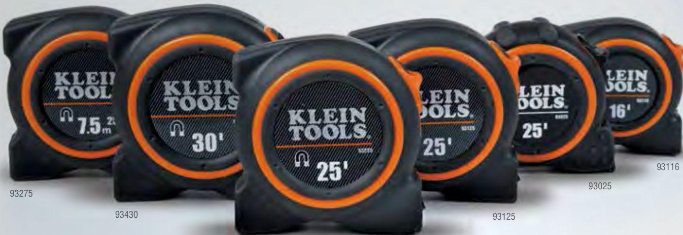
RARE EARTH MAGNETS