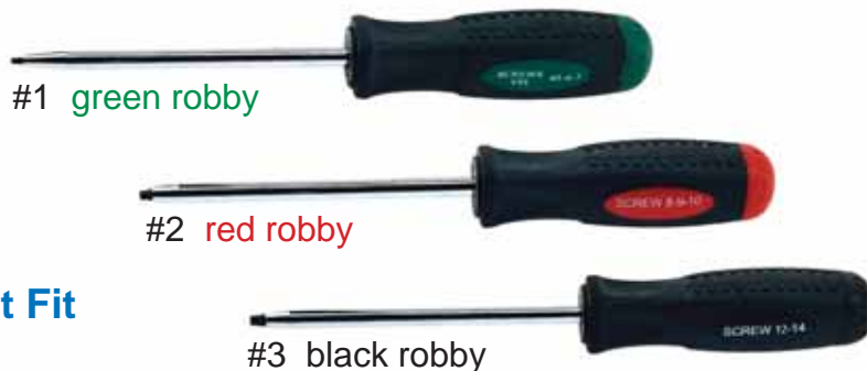
#1 green robbey