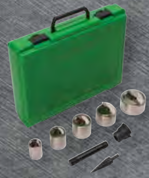
SPEED PUNCH™ KIT (without driver)*

Look for SPEED PUNCH™ products and "Try Me" display at supporting Greenlee distributors.