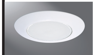
70PS Albalite Glass Lens, White Polymer Trim, White Trim