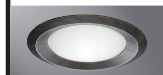
6150TBZ Tuscan Bronze Reflector