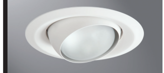
6130WH White Eyeball, White Trim

Compatible with Halogen, Incandescent, LED* or CFL* lamps.